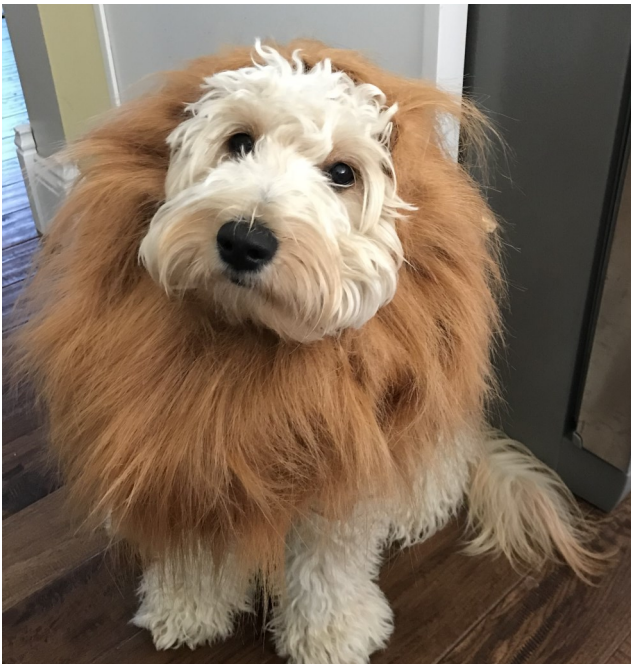
Desi Shrader—Trunk or Treat